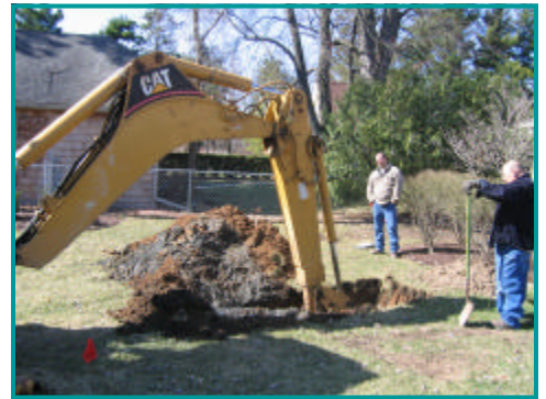
LCDPH sanitarians work closely with local excavators.