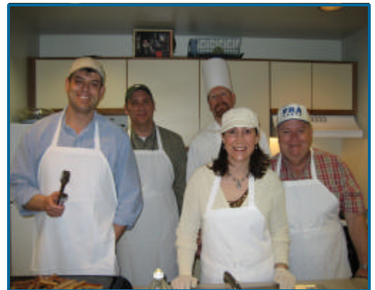
LCDPH Food Team participates in the Relay for Life fundraiser breakfast.