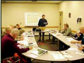
Citizen Planner Training

The Citizen Planner Program is a non-credit course series leading to an optional certificate of competency awarded by MSUE. The course is a series of up to twelve modules, each delivered in two-hour evening sessions.