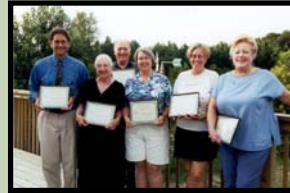
2001 Kent County Citizen Planner Certificate Awardees (23 total)

Earning the certificate involves the successful completion of six core courses and the performance of 30 hours of community-oriented service in land use planning or related activities.