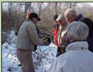
Instructor field training during a Citizen Planner session

Instructors for this course include members of MSU Extension staff, practicing planners, attorneys, university faculty, government officials, developers and other leaders involved in the local planning process.